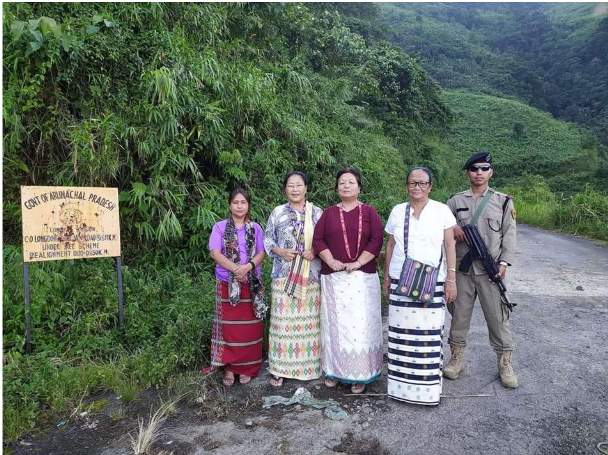
On 17th July 2022: APWWS (CEC) team hold meeting with Namsai Women's Welfare Society at Namsai.