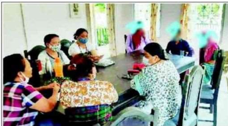
Members of the Miao APWWS unit with family members of the minor.