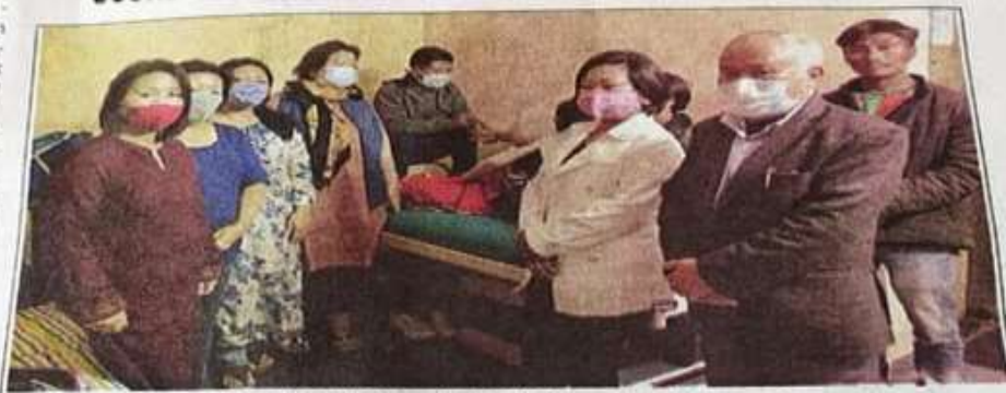
The APSCPCR and APWWS team in Dibrugarh