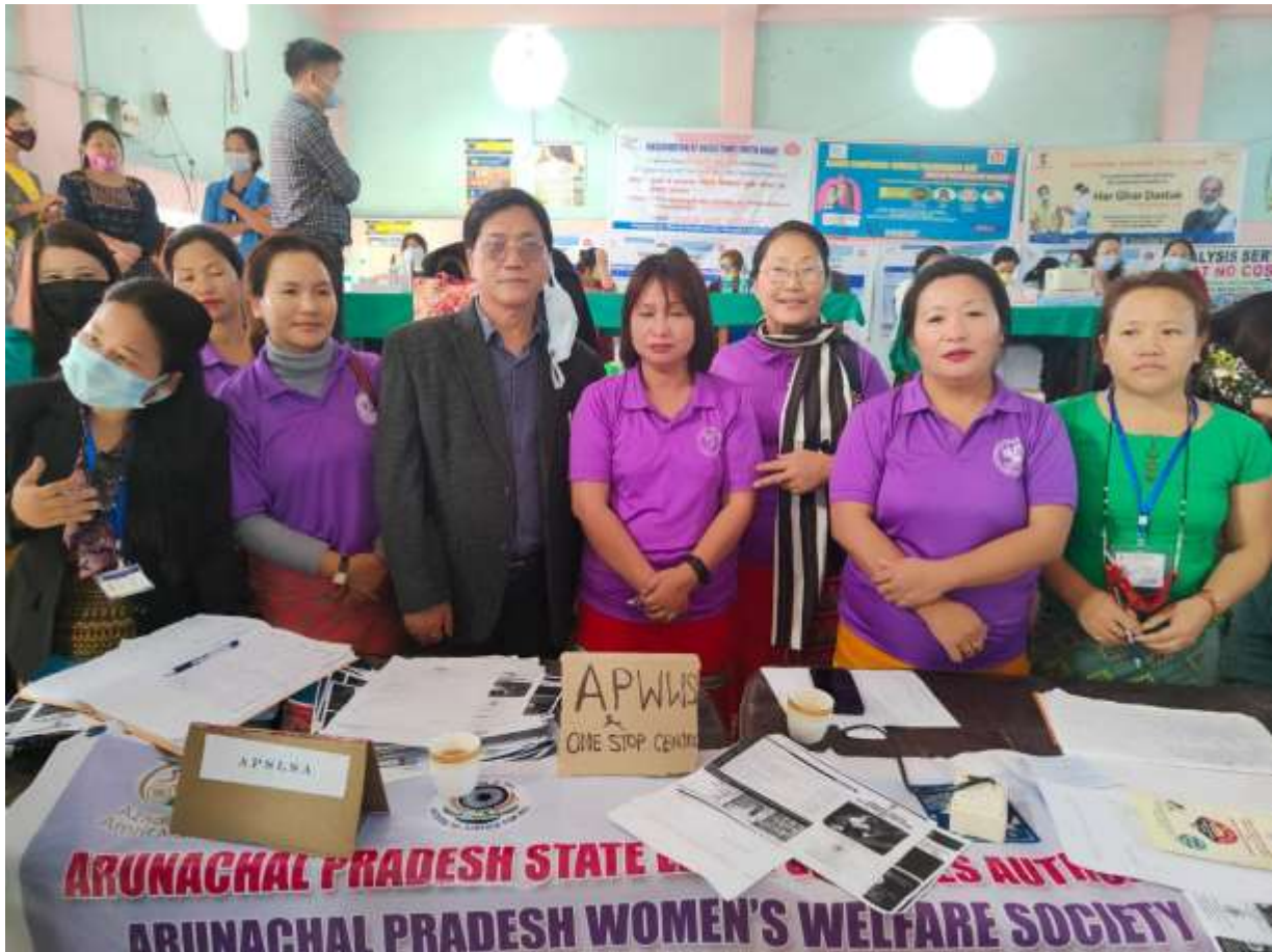
On 17 th December, 2021: Team APWWS, AP State Legal Services Authority and One Stop Centre, Naharlagun participated in Sarkar Aapke Dwar Dwar held at Community Hall, Borum, Itanagar.