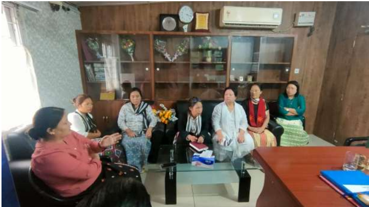
On 5 th August, 2022: A valedictory program at the APRB-RSETI for the conclusion of 15 Days Training Programme.