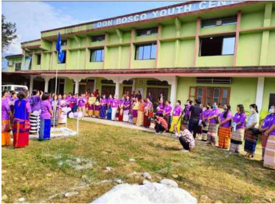
34 District Branches n Affiliated Bodies of APWWS across the State attended. Programme is still undergoing.