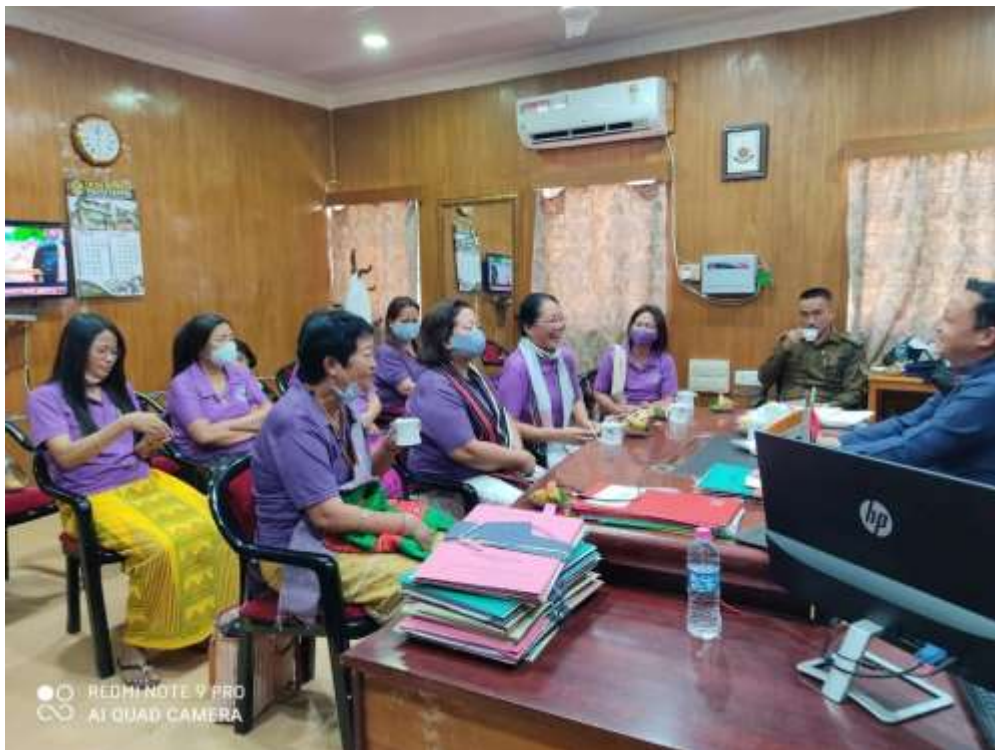
On 19 th November, 2020: The Central Executive Member and District Branches of the Arunachal Pradesh Women's Welfare Society (APWWS) and its affiliated bodies took out candlelight protests in various district headquarters and other towns of the state.