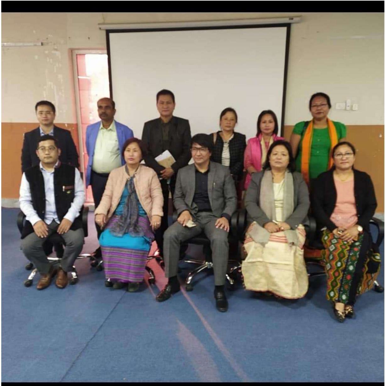
On 2 nd March, 2021: Meeting of APWWS (CEC) held today at APWWS Office, Mahila Imdad Bhawan, Naharlagun.