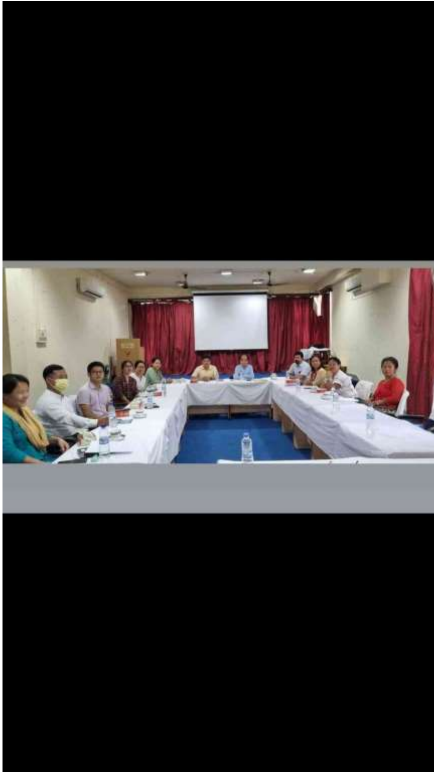
On 10 th October, 2021: 42nd Foundation Day Celebration of Arunachal Pradesh Women's Welfare Society at Don Bosco Youth Centre, Vevik Vihar Itanagar.